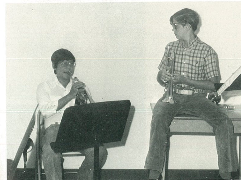
That wasn't a wrong note, my valve just got stuck.